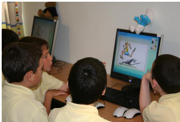
Fig. 3. Students attentively follow an educational slideshow presentation about nutrition

In order to evaluate the capabilities of our prototypical system, we ran a demonstrative deployment with the help of a class of thirty students, aged between nine and ten, from a primary state school. The setup consisted of eight computers for the students, each having three to four mice, and a computer for the teacher. Each student individually controlled a mouse to which a cursor with a specific unique color was associated. The computers, on the other hand, were assigned a unique name corresponding to the soft-toy placed on the top of the monitor.