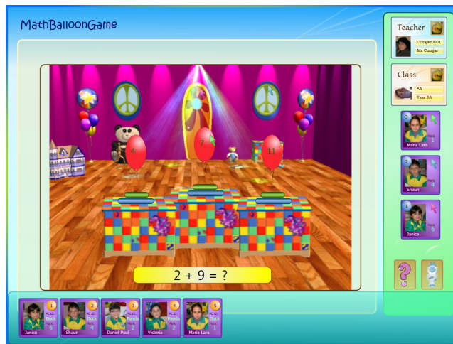
Fig. 4. The MathBalloonGame deployed within the student client

WhiteBoard and PaintingProg follow the same principle. WhiteBoard , as the name suggests, acts as a virtual whiteboard which the teacher can use to visually illustrate concepts to the students while explaining. PaintingProg works on the same idea as WhiteBoard , but instead of having the teacher as the centre of attention in the class, we have the students trying to explain words to each other through illustrations by means of an engaging Pictionary-like game which encourages collaboration and competitiveness amongst the students.